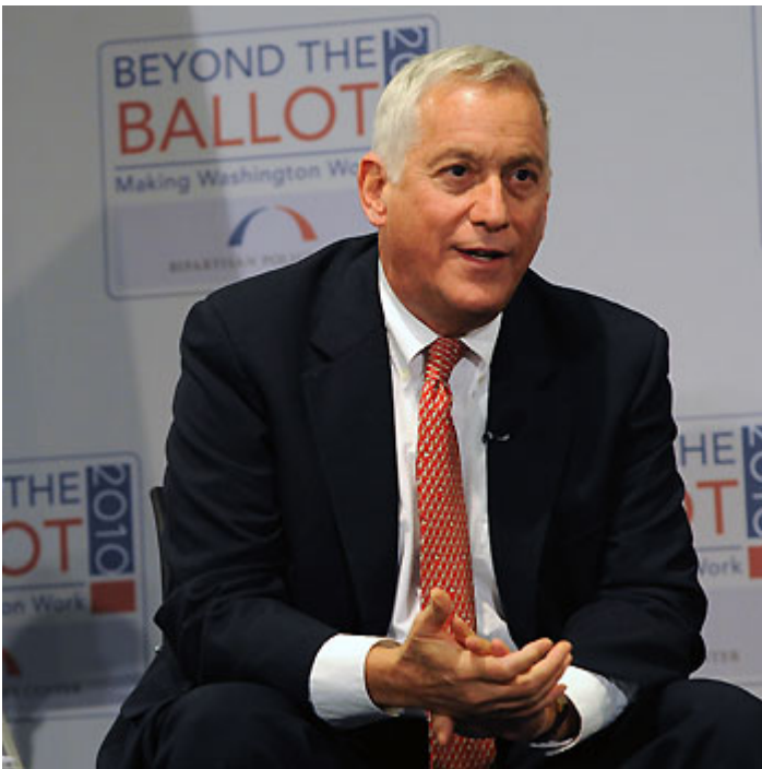
Taking part in the panel discussions is Walter Isaacson, a member of the Board of Tulane and president and CEO of the Aspen Institute. He also is a board member of the Bipartisan Policy Center.