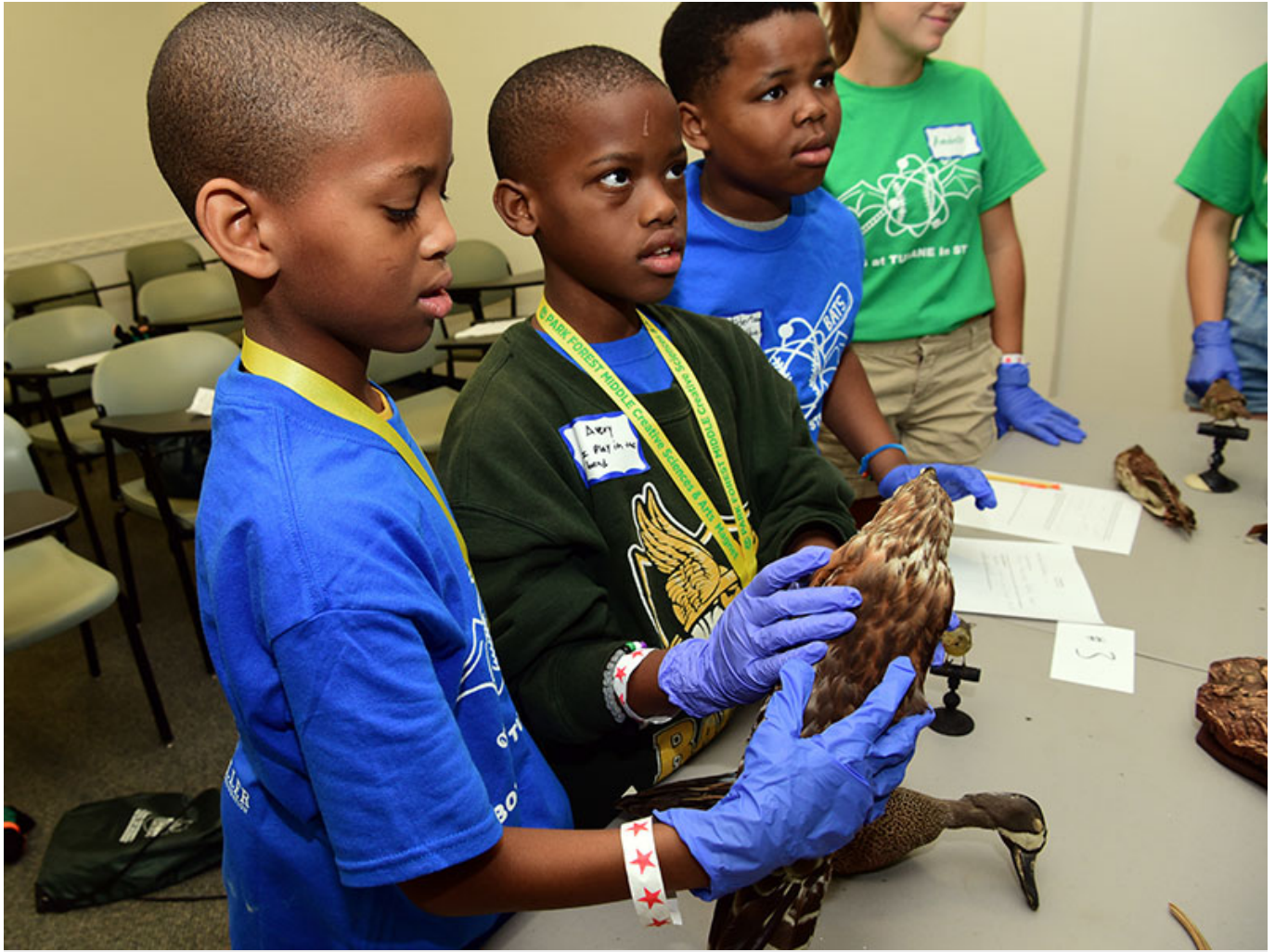
Students examine different species of birds.