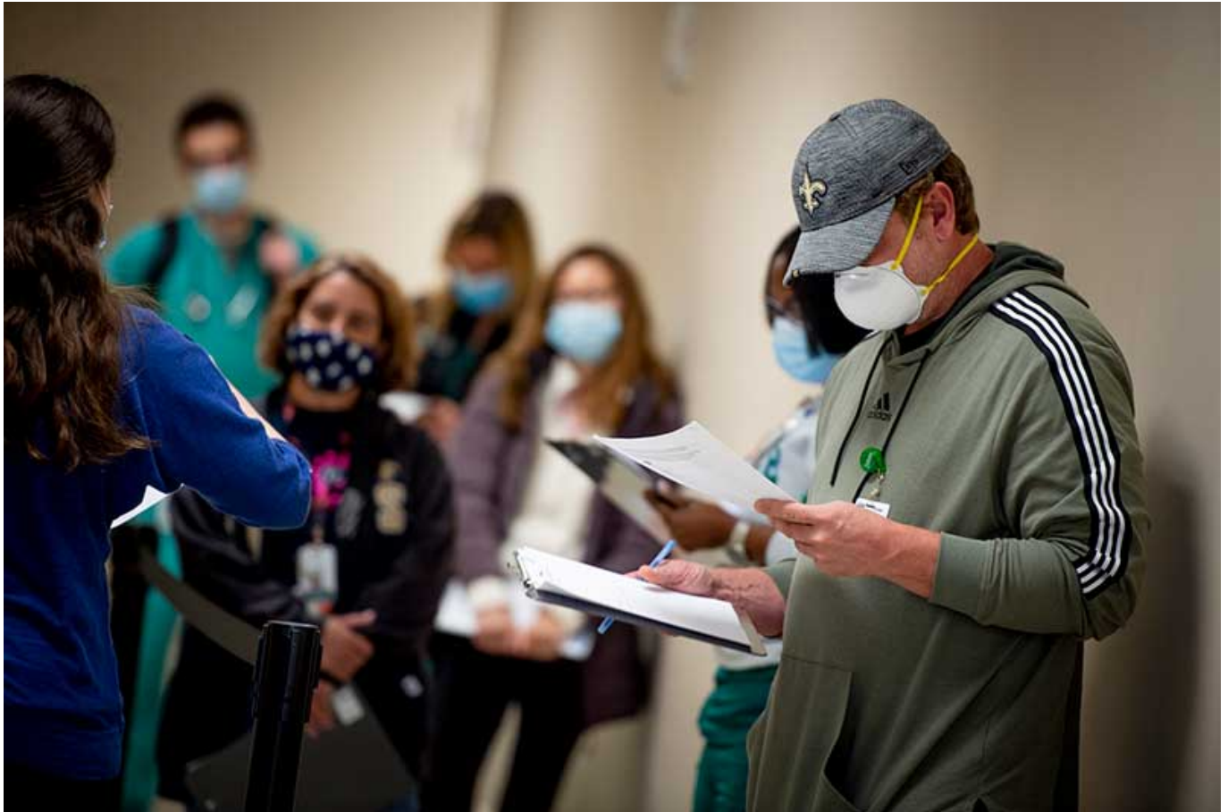
Frontline healthcare workers fill out consent forms while they wait to receive the vaccine.