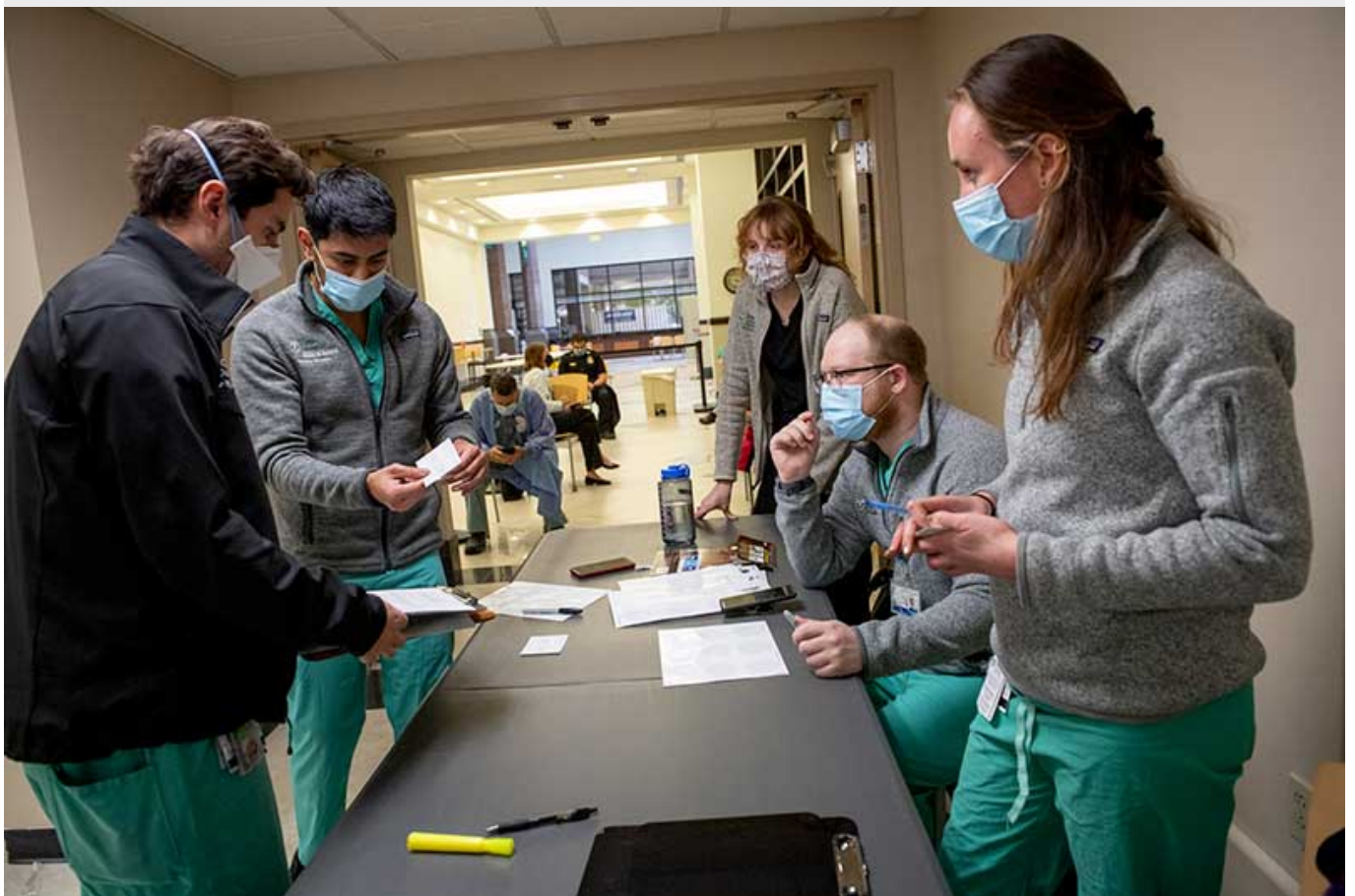
Tulane medical students assist with post-vaccination protocol.