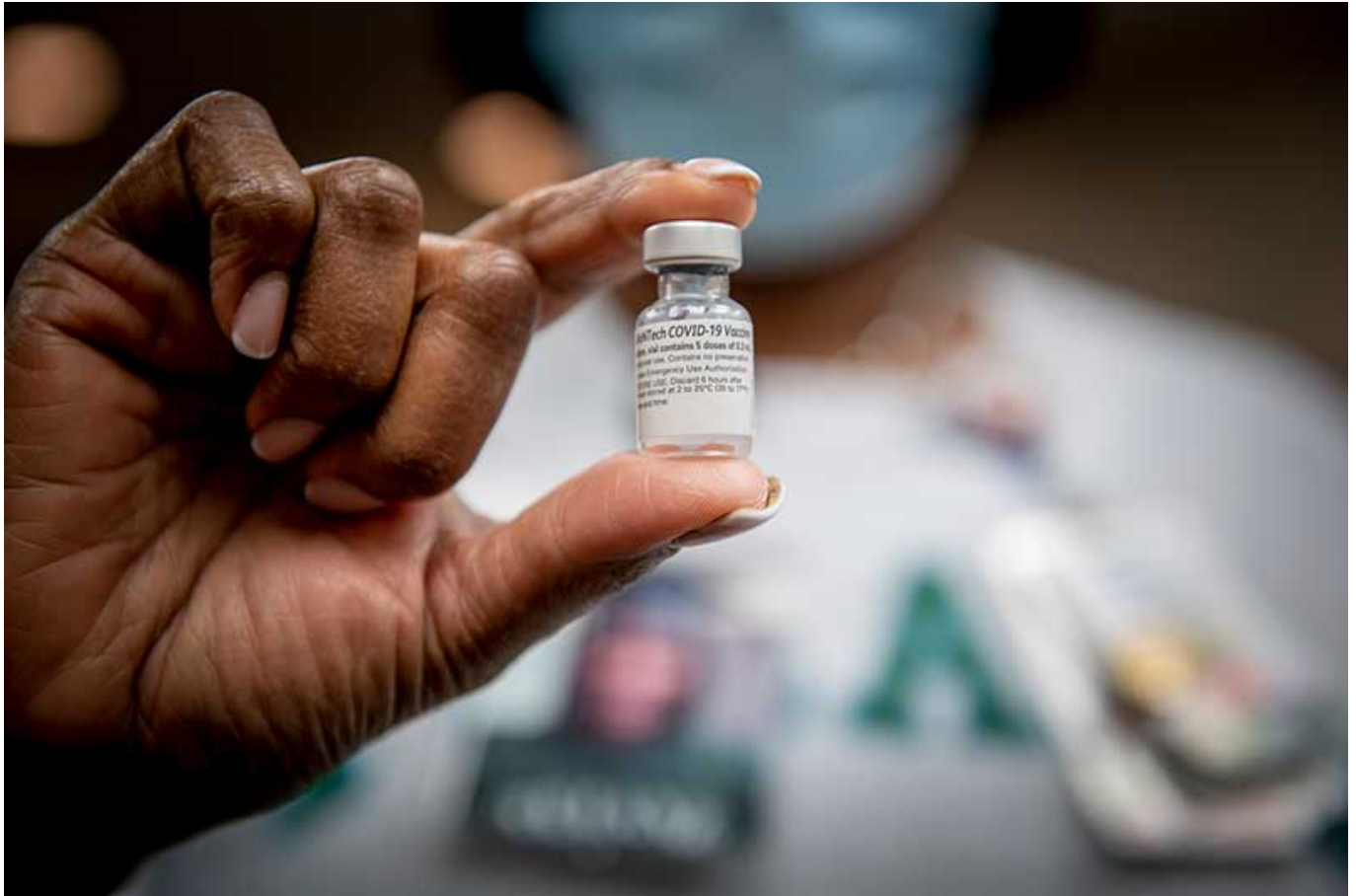
Each vial of the Pfizer COVID-19 vaccine holds five doses.