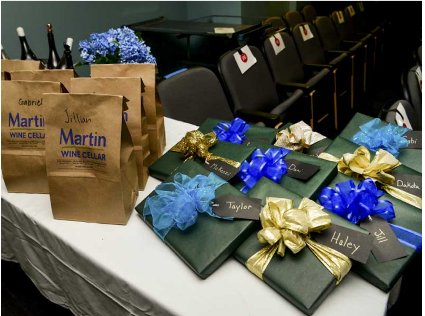
Gifts are neatly arranged nearby for a post-ceremony celebration.