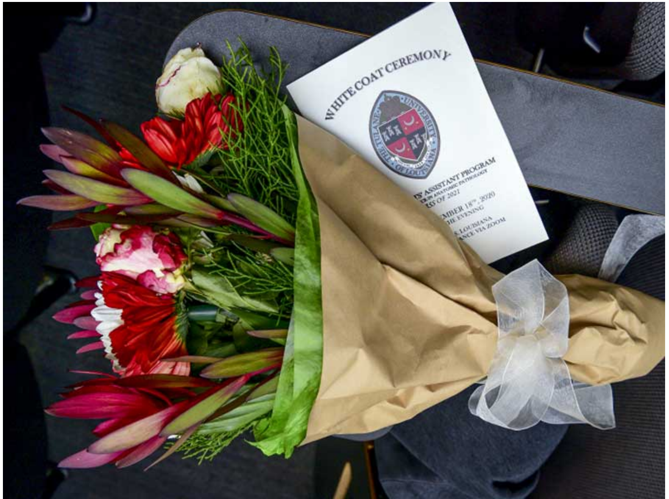
Family and friends were able to watch the ceremony via Zoom.