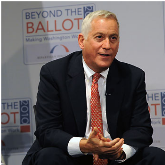
Taking part in the panel discussions is Walter Isaacson, a member of the Board of Tulane and president and CEO of the Aspen Institute. He also is a board member of the Bipartisan Policy Center.