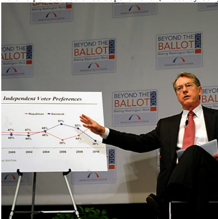
At the opening of the summit, Whit Ayres, president of a national public opinion and research firm,