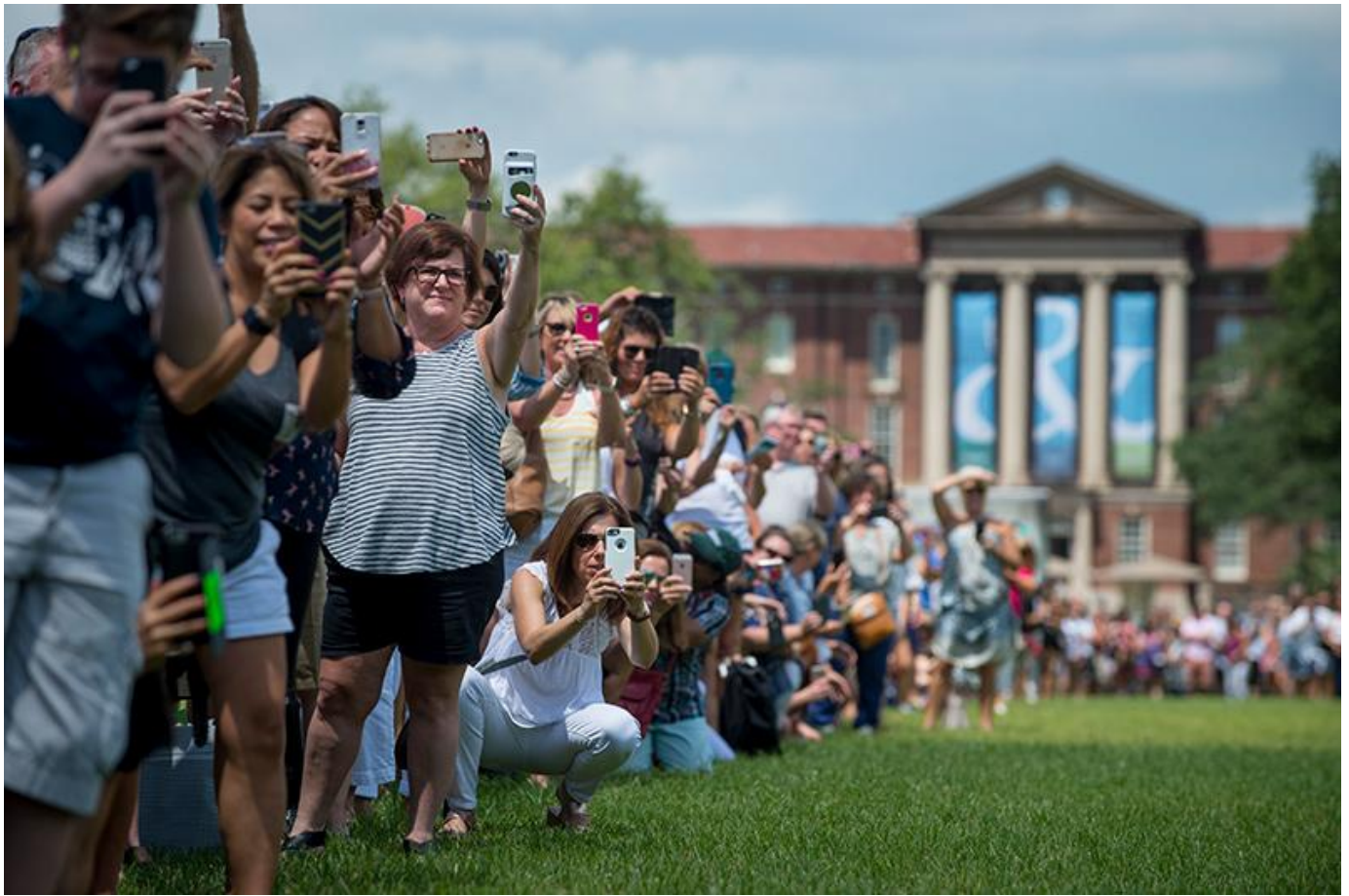
Parents assemble parade style outside of McAlister Auditorium to greet students as they exit the 2017 President's Convocation.