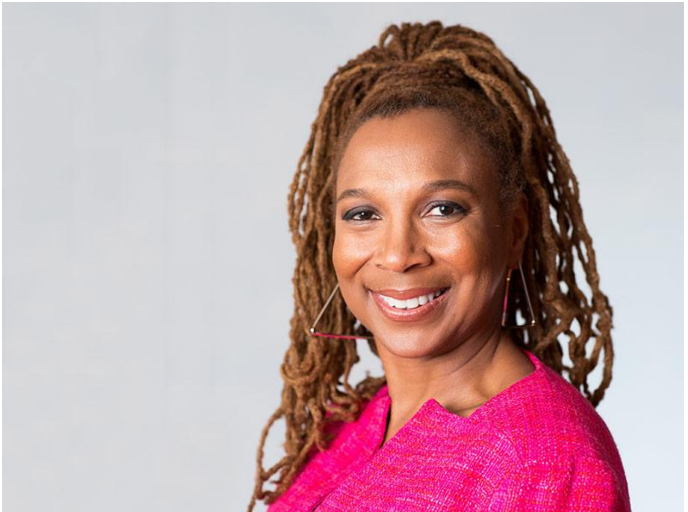
Kimberlé Crenshaw is a professor of law at UCLA and Columbia and a foundational scholar of critical race theory and intersectionality.