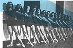
NEWCOMB DANCE PROGRAM