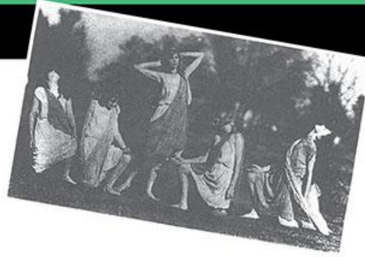
NEWCOMB DANCE PROGRAM