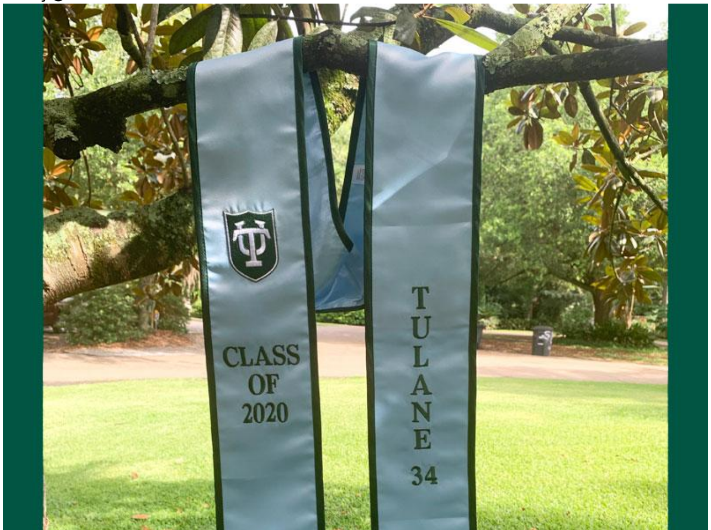
Tulane 34 Award recipients from the Class of 2020 received a stole in honor of the university-wide recognition.

Tulane University Office of Student Affairs recently bestowed the prestigious "Tulane 34" awards on 34 members of the Class of 2020.