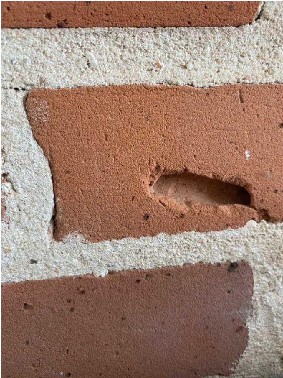
The note was found in a crevice in the wall in Monroe Residence Hall.