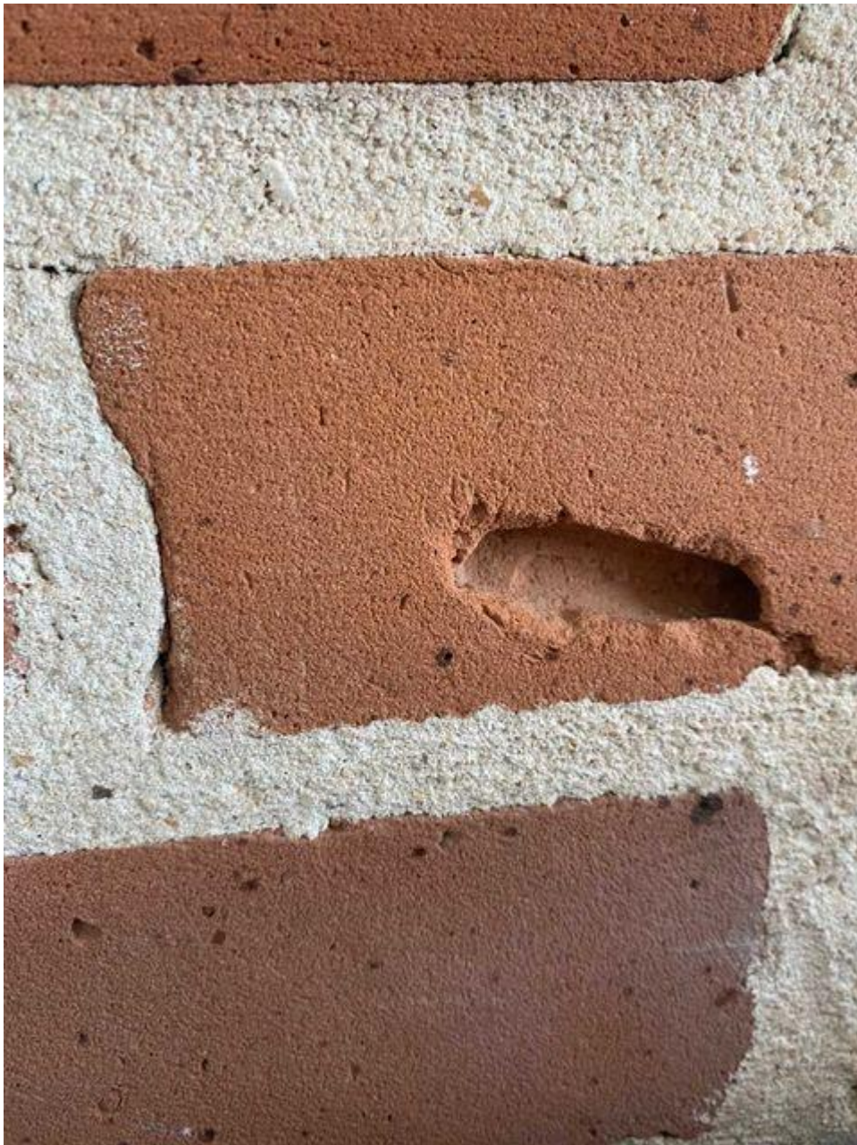
The note was found in a crevice in the wall in Monroe Residence Hall.