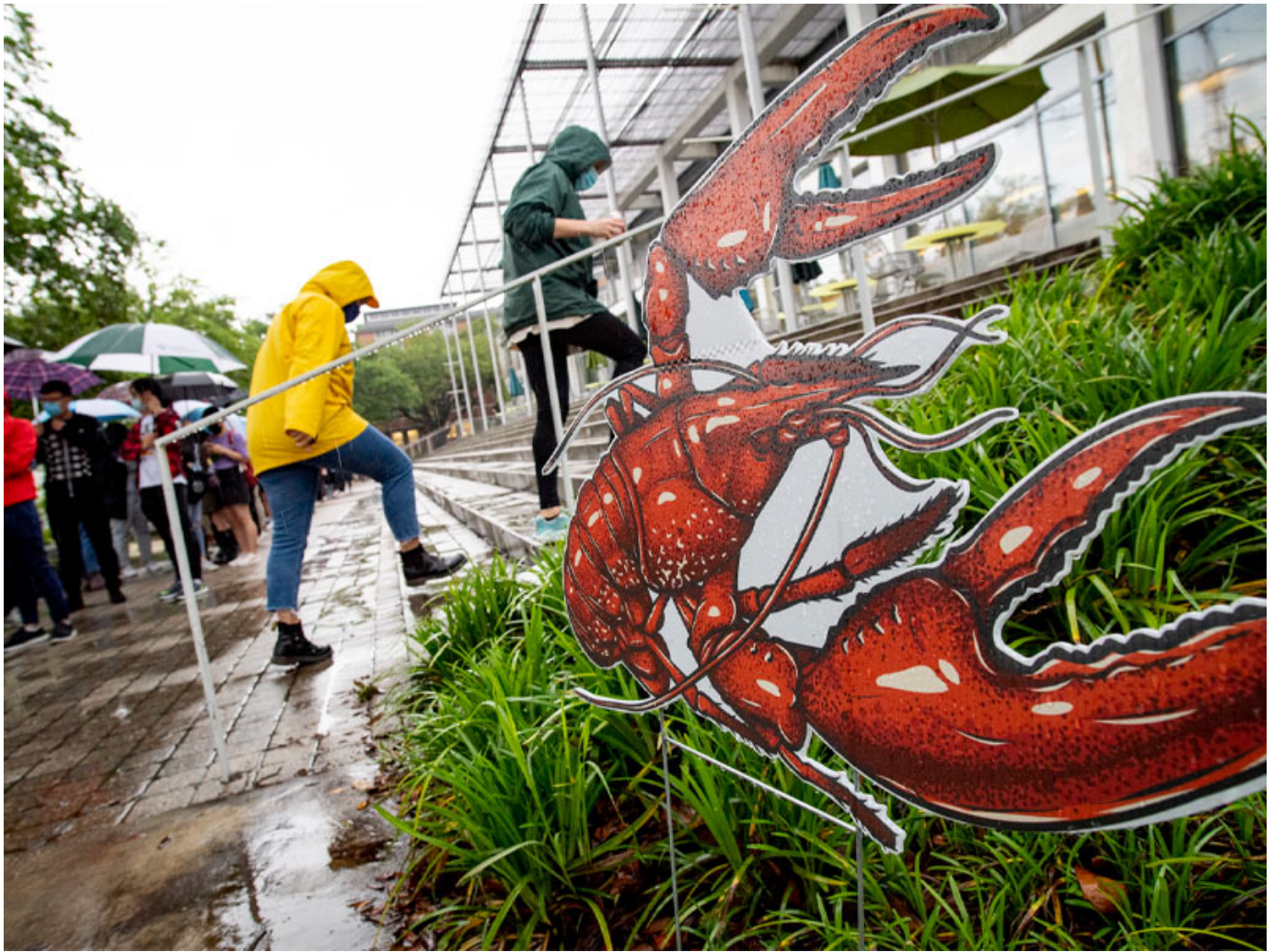
Members of the Tulane community waited in the rain outside the Tulane Dining Pavilion on the Berger Family Lawn, the site for Crawfest 2021. For COVID-19 safety, only 200 diners were allowed inside at any given time.