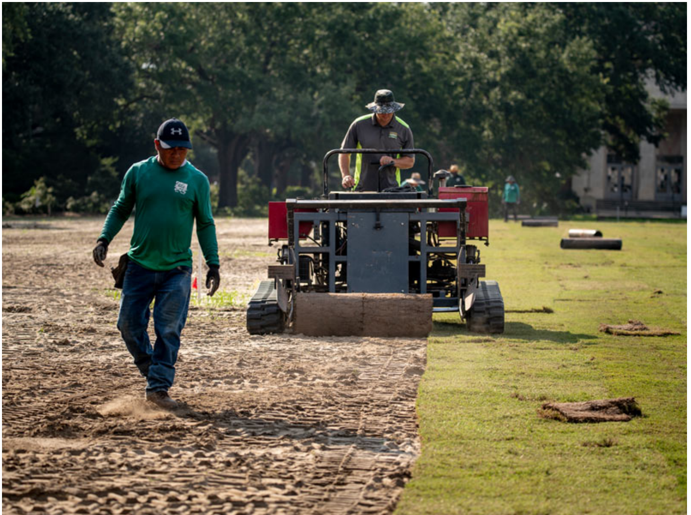
New sod is placed on Berger Family Lawn. The quads on the uptown campus were refurbished after the deconstruction of 13 temporary buildings that included classrooms and a Dining Pavilion. The additional structures were erected to provide more spaces for social distancing within classroom environments.