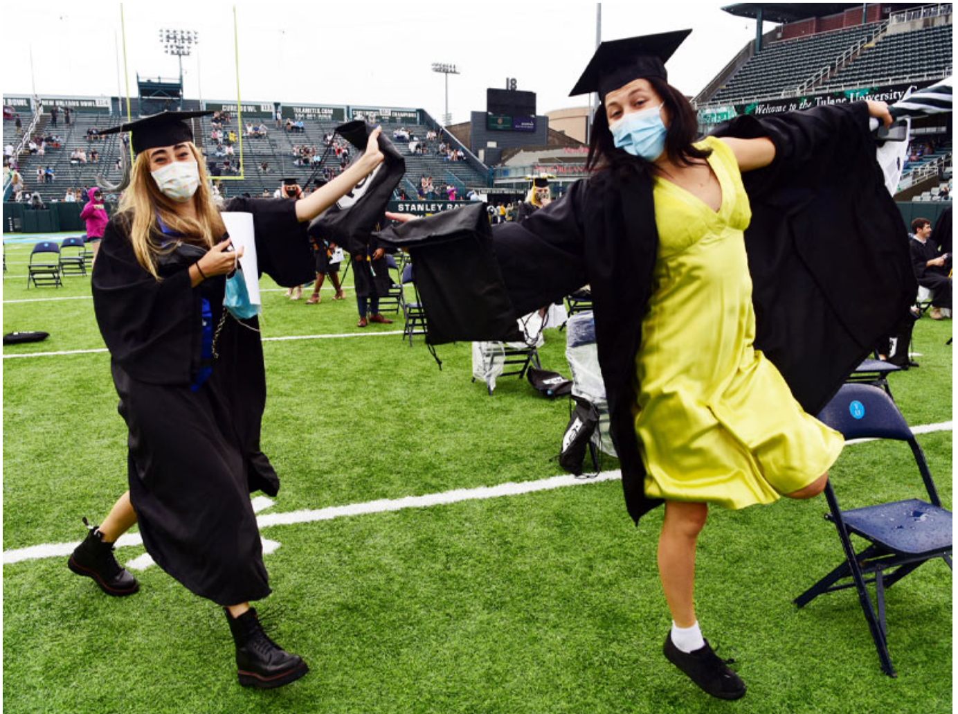
Students show their excitement at the School of Liberal Arts Commencement ceremony held in Yulman Stadium. Nine individual school ceremonies were held over the course of three days: May 19-21, to celebrate the Class of 2021.