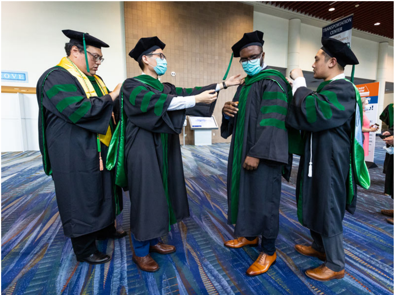
Candidates for Doctor of Medicine help each other with their regalia before the start of the 2021 School of Medicine Commencement ceremony. The ceremony was the last of the university's in-person individual school Commencement ceremonies.