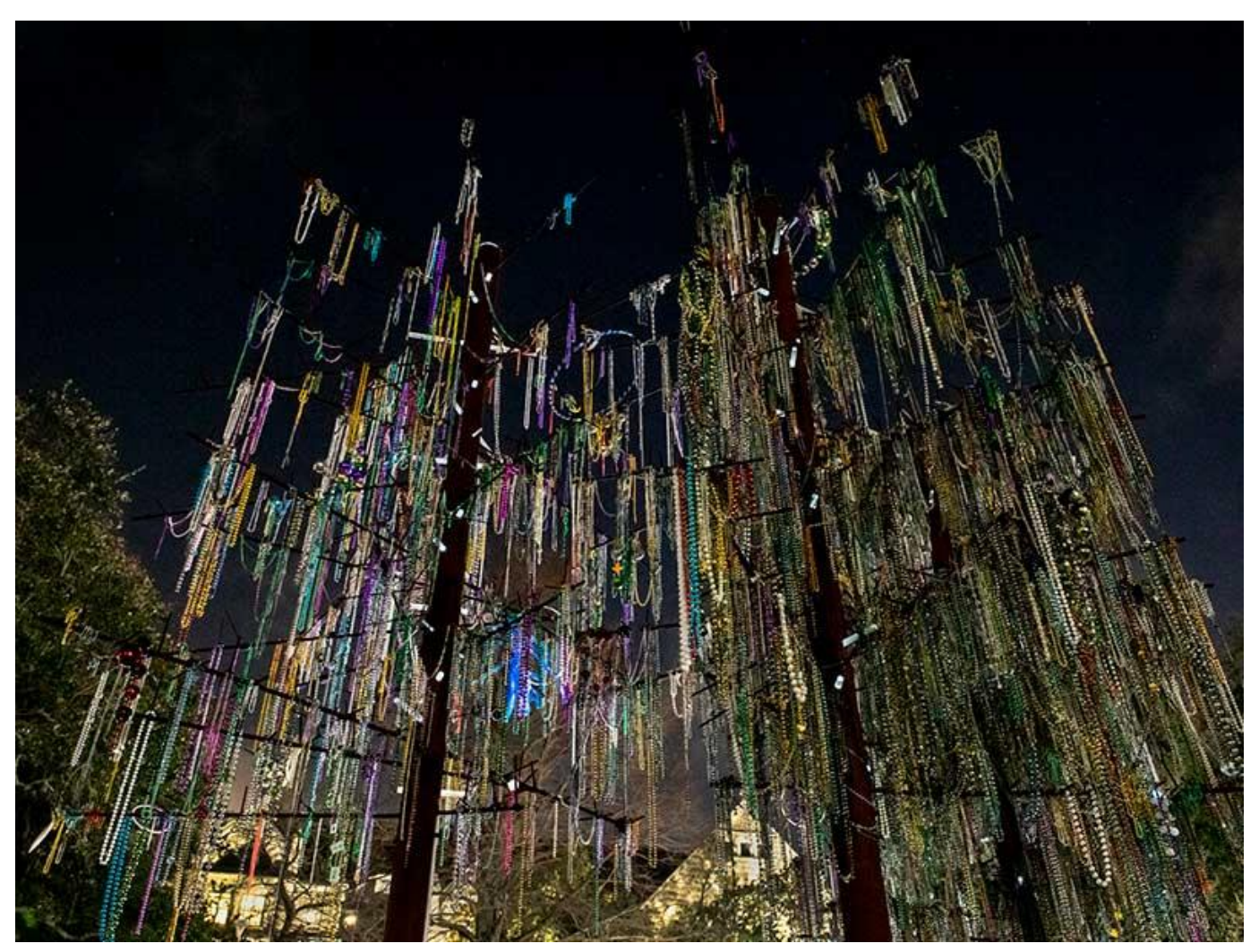
Gibson Hall is illuminated with Carnival colors of gold, green and purple in time for Mardi Gras. (Photo by Paula Burch-Celentano)

On Gibson Quad, the Bead 3 sculptures are heavily draped in Mardi Gras beads and lit during the evening hours. (Photo by Paula Burch-Celentano)