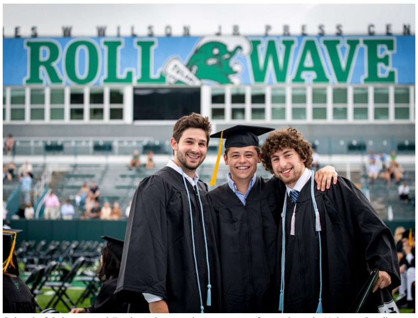
School of Science and Engineering graduates pause for a photo in Yulman Stadium in May 2021.