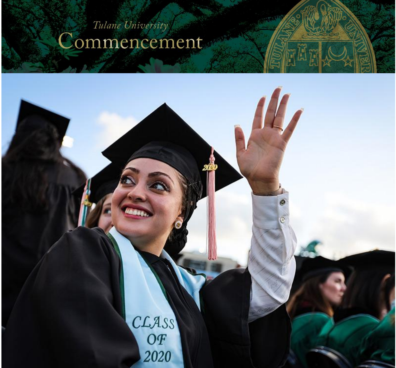
Graduates of the Class of 2020 returned to campus for a Commencement ceremony in Yulman Stadium on April 22, 2022.