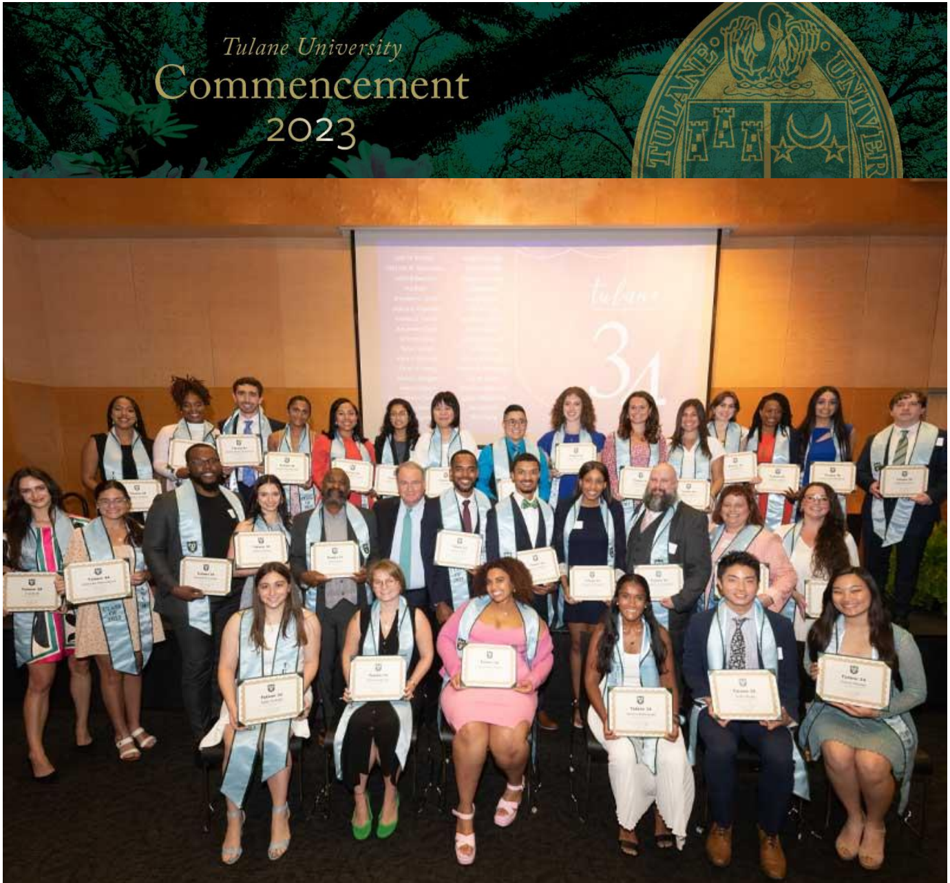
Tulane 34 recipients are recognized for their exemplary leadership, service and academic excellence.

May 19, 2023 11:00 AM Tulane Today staff today@tulane.edu