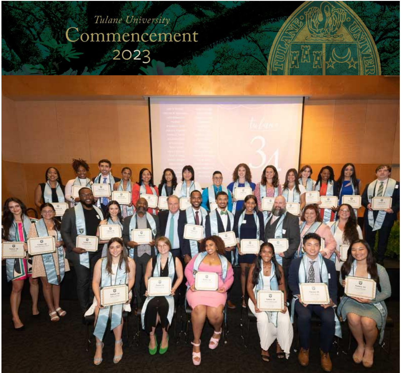
Tulane 34 recipients are recognized for their exemplary leadership, service and academic excellence.

May 19, 2023 11:00 AM Tulane Today staff today@tulane.edu