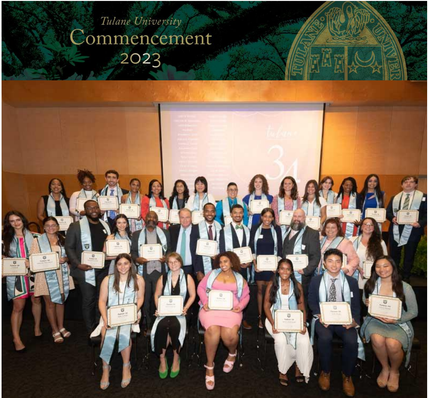
Tulane 34 recipients are recognized for their exemplary leadership, service and academic excellence.

May 19, 2023 11:00 AM Tulane Today staff today@tulane.edu