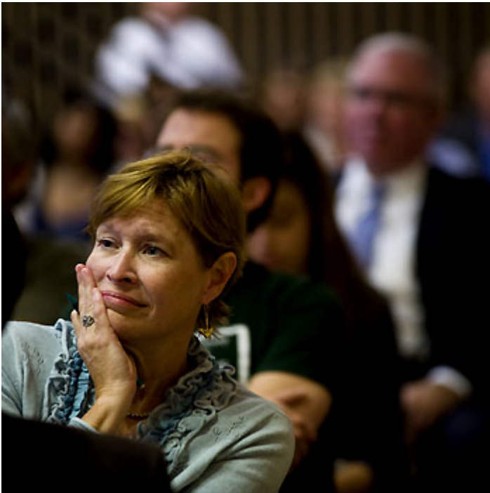
Discussions about the national political climate engage the audience members, who also lined up to pose questions to the speakers at the event, held on Tuesday (Nov. 9).