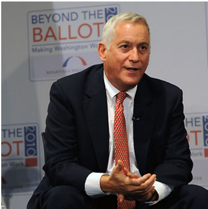
Taking part in the panel discussions is Walter Isaacson, a member of the Board of Tulane and president and CEO of the Aspen Institute. He also is a board member of the Bipartisan Policy Center.