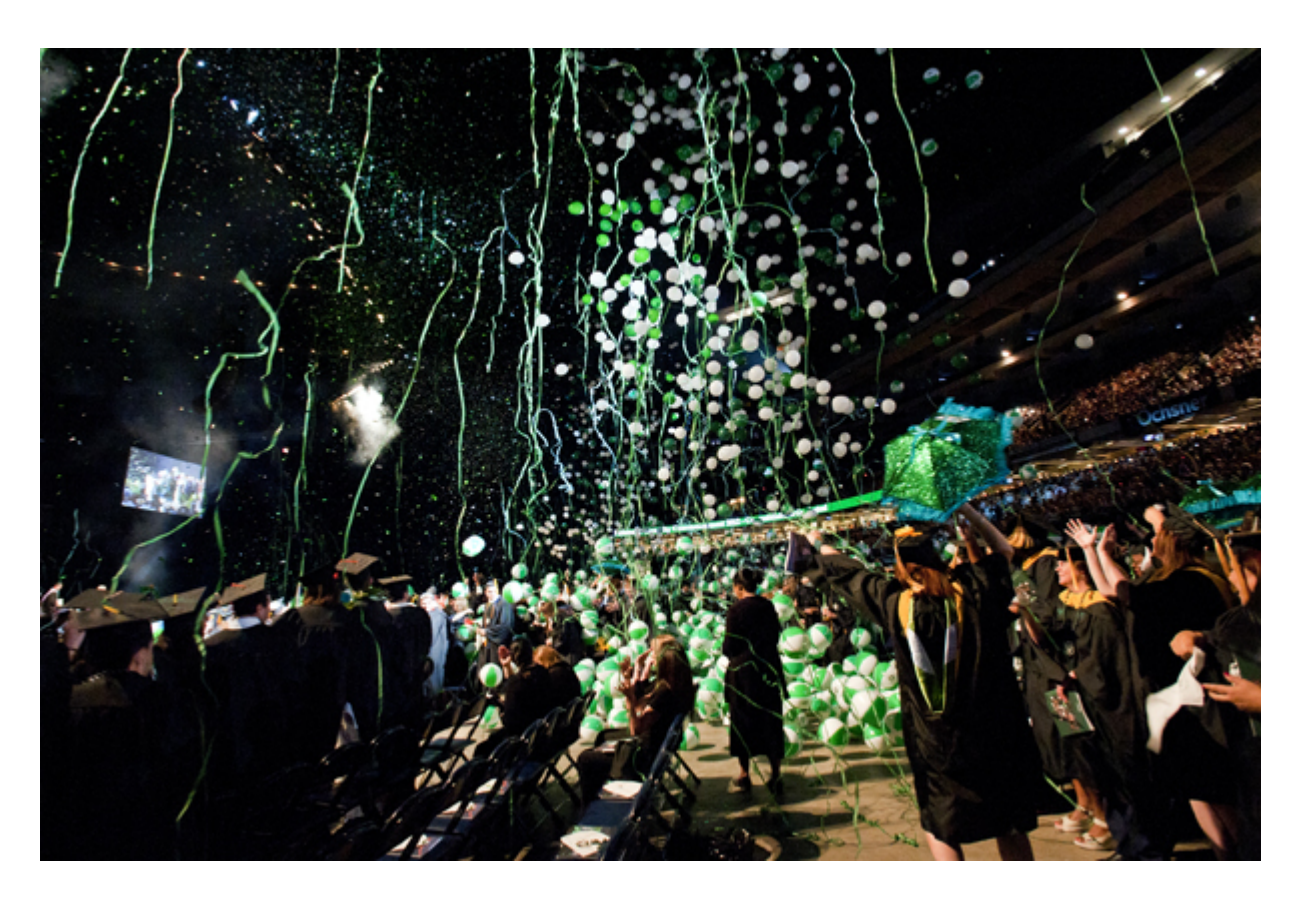
A colorful shower of confetti, balloons and beach balls drops on the assembled 2,700 graduates, the newest group of Tulane alumni.