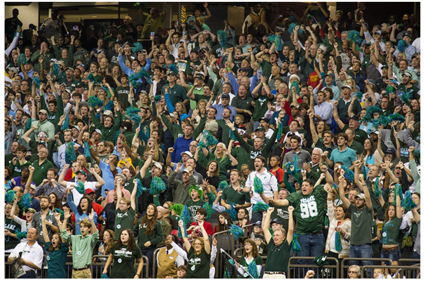
More than 54,000 fans set a New Orleans Bowl record for attendance.