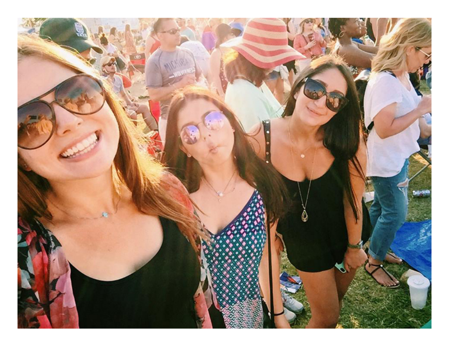
For giving me the opportunity to see my favorite musician perform at Jazz Fest.